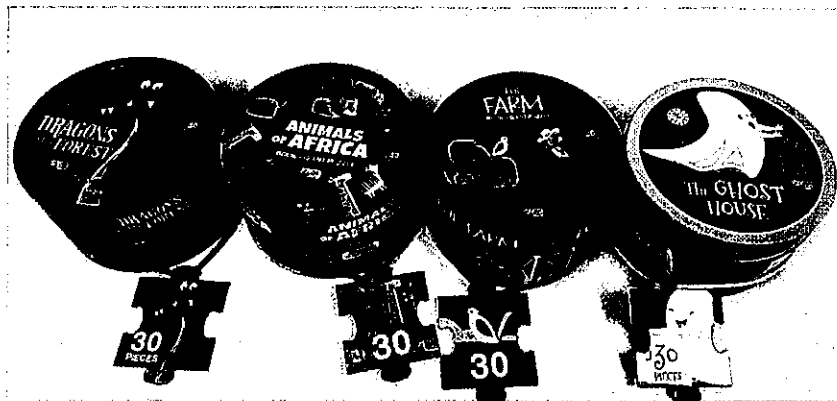
Storybook gift boxes

In order to promote reading and encourage sharing among students, the school is holding a 'Book Swapping Activity'. When students finish reading their own book and completing one part of the worksheet, they can bring the book back and swap it with their classmates. After reading all four books and completing the whole worksheet, students can submit the worksheet to their English teacher. They will be given a little gift as encouragement. The deadline is 28 th February, 2018. It is not a compulsory activity, but an attempt to encourage students to read. We also encourage parents to read with their children.